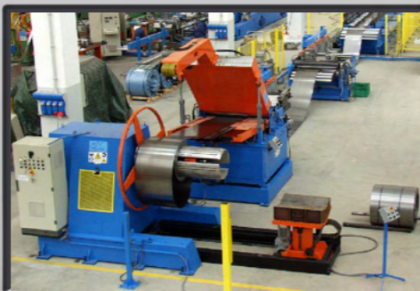
Decoiler and shearing bench