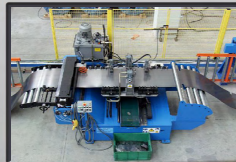
Detail of shearing bench