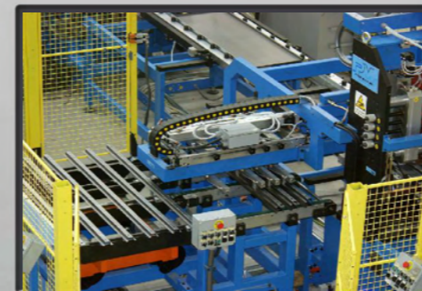
Detail of reinforcement loader