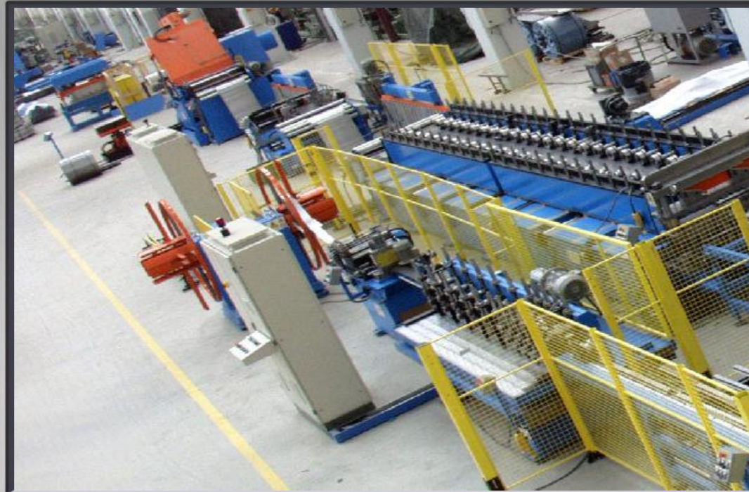
View of shelf line and reinforcements

Speed about 7 pcs/min with 1000 mm length Line colour blue RAL 5015