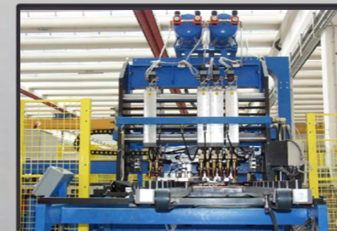
Detail of reinforcement point-welder