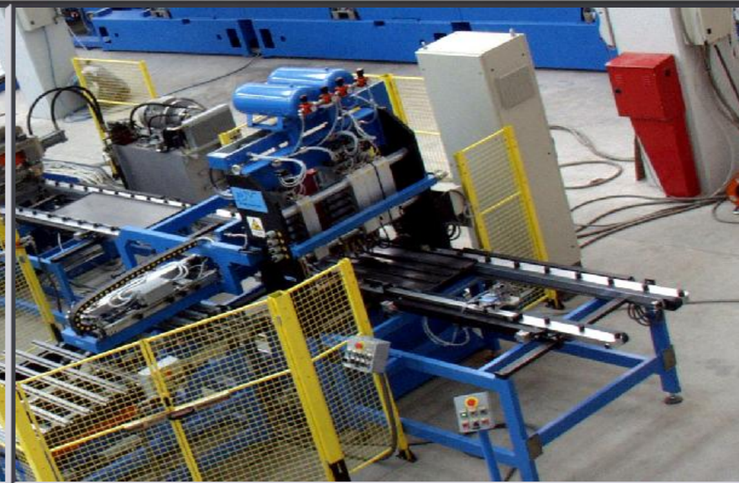
View of shelf line and reinforcements